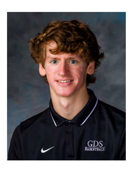
WILLIAM OTTO GREENSBORO DAY SCHOOL