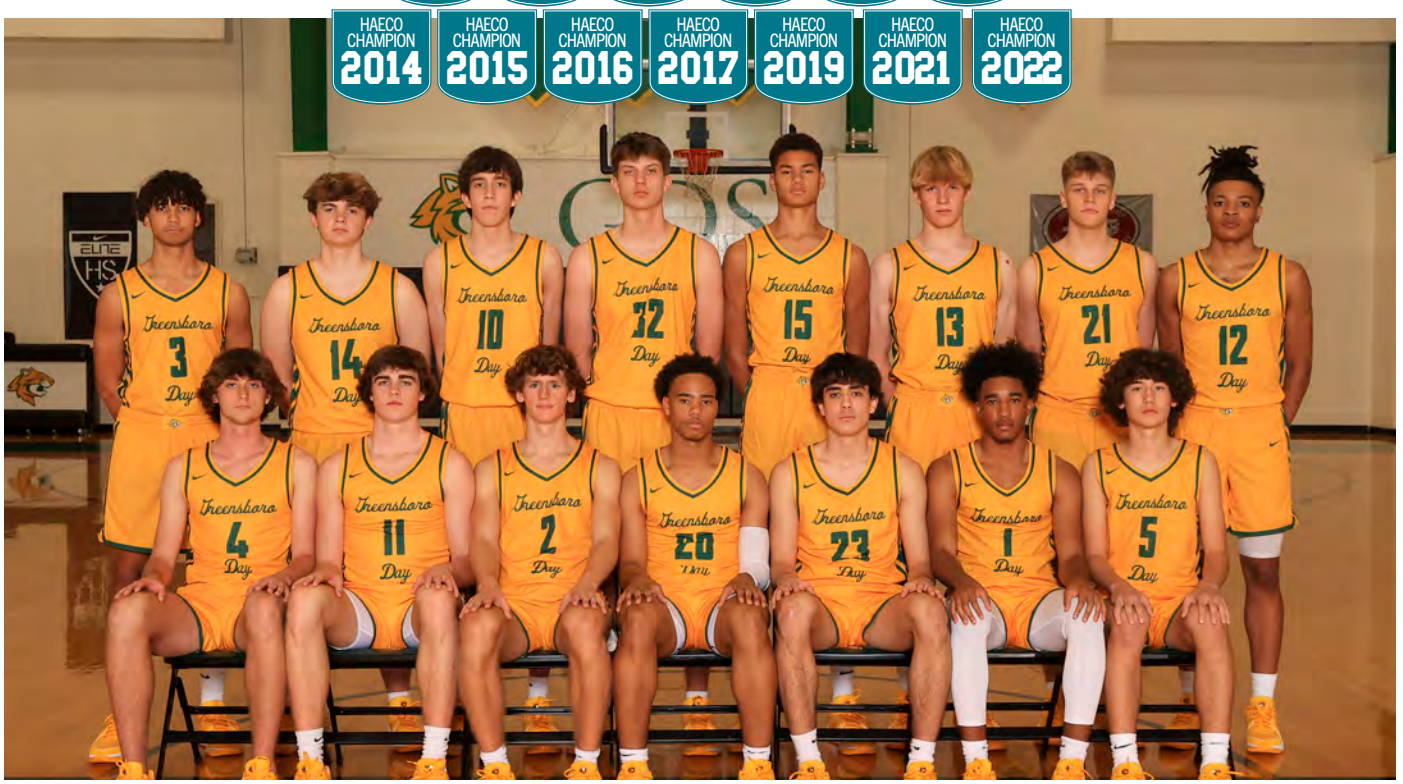
*not pictured: Jagger Emerson